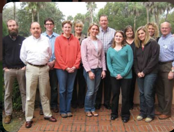
JIMI Class of 2009

Applicants should have at least two years full-time museum experience. Application deadline is October 31, 2009. Successful applicants will be notified by November 13. The SEMC Central Office must receive tuition by December 31.